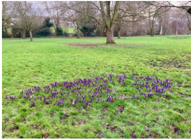
Crocuses in early Spring in Oakhill Park, East Barnet.

WE WISH YOU A VERY HAPPY AND BLESSED CHRISTMAS FOLLOWED BY A PEACEFUL AND FULFILLING NEW YEAR.