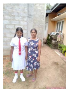
Echini aged 13